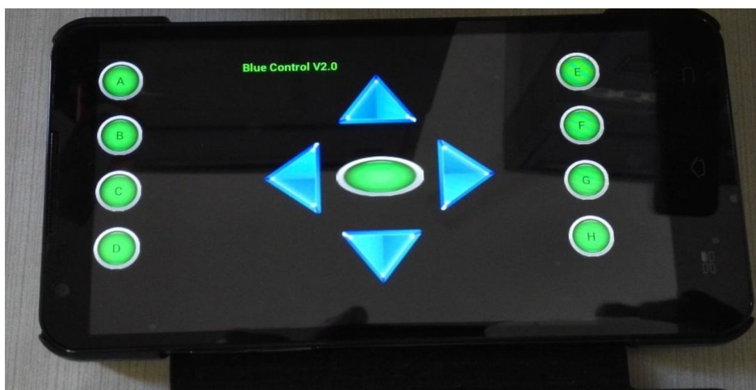
Fig. 1. Main menu screen

The interface was implemented over a Tablet. The interface implementation consists of thirteen screens with five devices and lighting being controlled. Figure 1 presents the screen of our proof of concept implementation. As shown in fig.1.