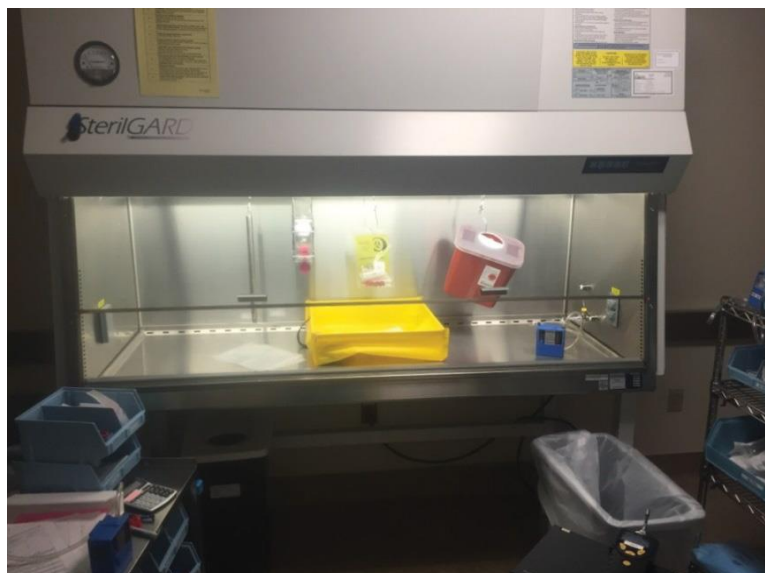
Figure 2. Typical air sampling set-up during a spill condition