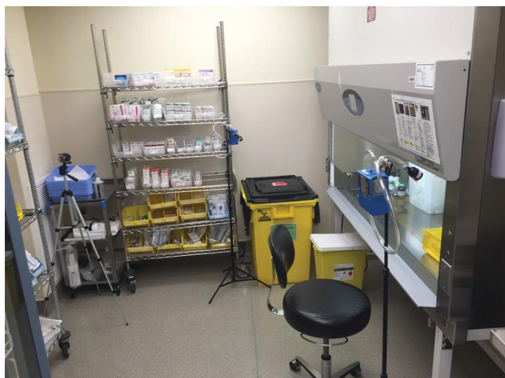
Figure 1. Typical air sampling set-up during a spill condition

The facility's engineering, administrative, and personal protective equipment controls for compounding activities were observed and noted for each site.