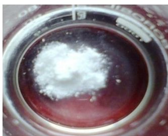
Figure 2: Effect of Wetting on Paracetamol Dispersible Tablets