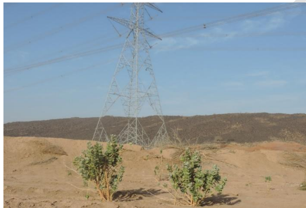
Figure 1: A photo taken by other showing example of one sampling area which describing the field conditions

The Arid conditions at the study area is extremely difficult (Fig 1). Average annual precipitation is less than 60 mm, summer temperature more than 45 °C, wind storms, wind erosion, salinity, drought and lack of fresh water resources are the key features of studied area. The climate in the study area is hot most of the year especially during summer time (Table 2). The diurnal mean of temperature fluctuated between a maximum of 39.7°C in June and 18.8°C in January with an annual mean temperature of 31.1°C. Also, the minimum temperature during the night ranges between 18.6°C in February and 29.1°C in August with a mean of 24.4°C in January and 34.4°C in June with a mean of 37.7°C. The relative humidity is high and ranged between a minimum of 81% and a maximum of 100 in December. The total precipitation is 128 mm with an average annual participation varies between zeros June to about 37.3 mm in November (Metrology and Environment, 2014).