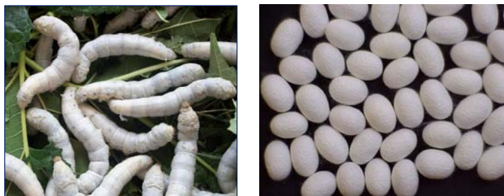
Fig. 3. Larvae and cocoons of APS45