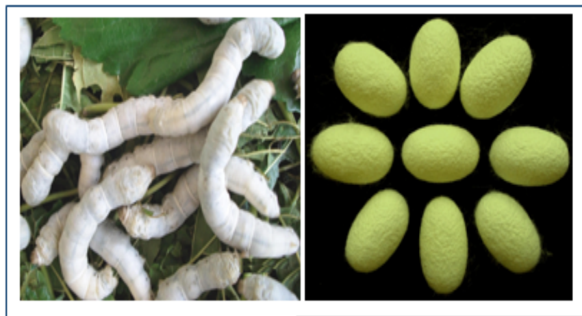
Fig. 1. Silk worm Larvae and cocoons of MSO3

The breeds APMG4 (females) and APMG16 (males) were used as initial parents for this plan. The F 1 progenies were raised by brushing composite layings and mass rearing was carried up to F 3 followed by cellular rearings. The cocoons were categorized into two types i.e. , medium and elongated oval based on cocoon shape and breeding was continued by selecting medium oval type of cocoon. The population which showed uniformity in cocoon shape and consistent in the economic characters by F 12 generation was considered as fixed and it was named as MSO3.