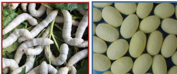
Fig.4. Silkworm larvae and cocoons of MSO3 x APS45

The larvae are bluish white in colour and cocoons are greenish yellow with medium grains. The larval period varied between 21 – 22 days. The hybrid (Fig. 4) showed overall merit for quantitative and qualitative traits compared to the control hybrids viz., APM1 x APS8 and PM x CSR2.