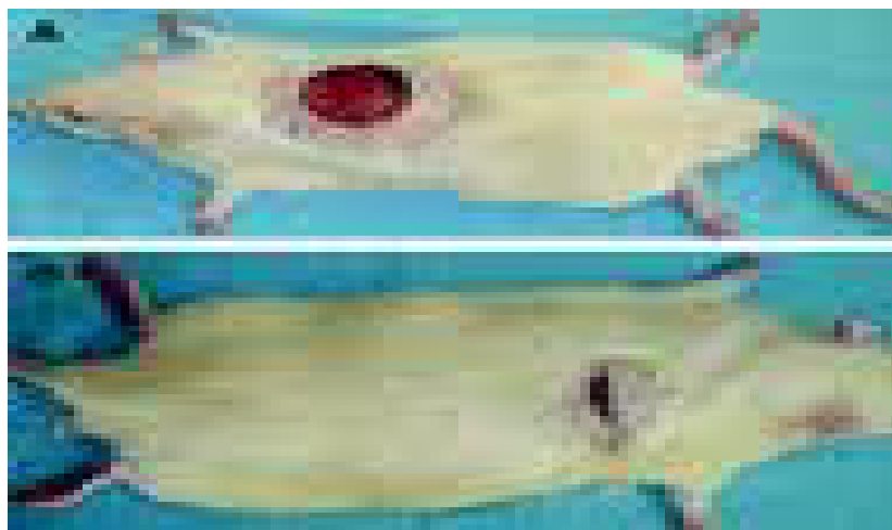
Figure 2. Before wound healing rat and after wound healing rat.