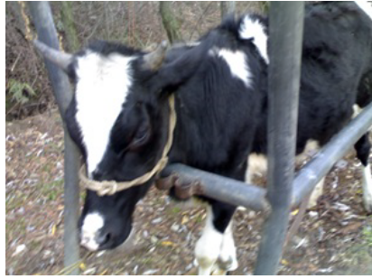
Figure 1. Freemartin heifer showing bullish characteristics.