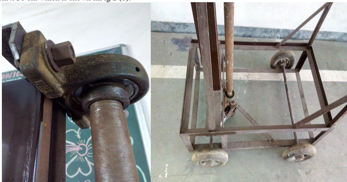
Fig.2 Design specifications (a) Journal bearing (b) Mechanical base

Base, as the name implies it is the base setup upon which all whole mechanical setup is kept. The base has a gap of rectangular shaped which is used to keep the battery, Lead screw and the electrical components. Size of the base setup is 120 cm x 80 cm x 50 cm which is shown in Fig 2 (b).