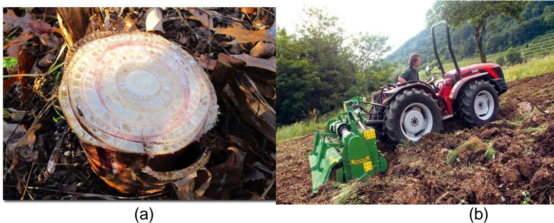
Fig 1. Existing methods (a) Direct decomposition method (b) Rotary Tractor method

In the existing direct decomposition method, farmers used to fill their cultivated land by water and kept it wet for five days [1]. After few days banana trees are made into big pieces which were buried into the wet clay using tractor as shown Fig 1 (a). This makes the banana tree to completely decompose within one month. The raw materials used in this process are wet clay. This method involves two types of work. One is cutting of trees and other is using tractor to complete process. This method is still followed by the farmers. In rotary tractor method the banana trees are crushed into pieces using tractor. The farming land is made dry and then tractor driven by skilled labour is made to cut the trees as shown in Fig 1 (b). Then the pieces are filled with water and let them undisturbed for some period to decompose completely. This method takes much time to cut the trees.