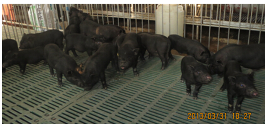
Figure 1. Obtained partly piglets derived from the fibroblasts of Diannan miniature pig.

Cloning efficiency (%) = No. of cloned piglets / No. of transferred embryos × 100.