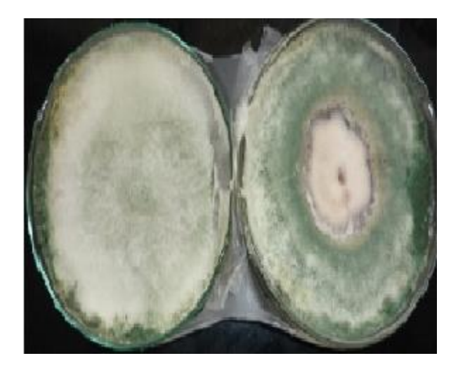
Figure 2. Effect of volatile compounds produced by T. viride on growth of F. oxysporum