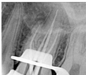
Figure 3. Mastercone Radiograph.