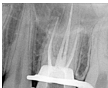
Figure 4. Immediate Obturation Radiograph.