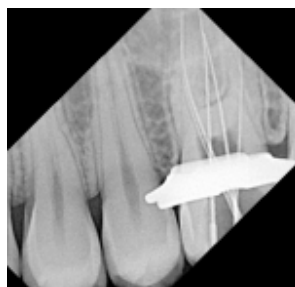
Figure 2. Working Length Radiograph.