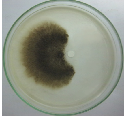
Fig 3: Aspergillus niger