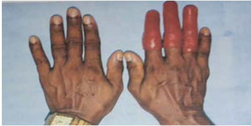
Figure 2: Patient hand with wax trial prosthesis.