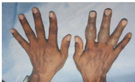
Figure 4: Completed silicon finger prosthesis.