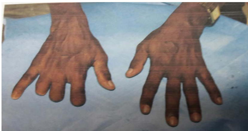
Figure 1: Patient's hand with amputated fingers.