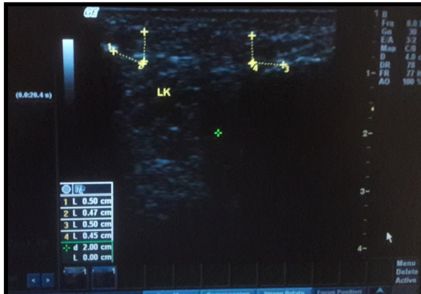
Figure 3: Patellar Tendon Measurement

History of DM in years has the minimum, maximum, mean and standard deviation were 3.00, 25.00, 3.57 and \pm 5.25 respectively as showed in (Table 3) . The significant correlation was found between the proximal part & the distal part of the right patellar tendon thickness and the proximal part & distal part of the left patellar tendon thickness of p-value 0.00, 0.01, 0.00 and 0.023 respectively with height as shown in (Table 4) .