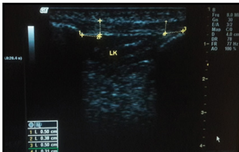
Figure 2: Patellar Tendon Measurement