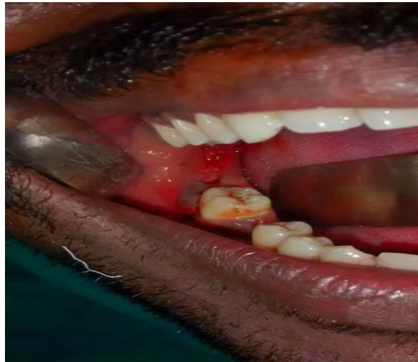
Figure 1. Intraoral image of impacted lower right third molar.

On clinical examination the region of 48 appeared to be inflamed with respect to the distal gingiva of 47. The diagnosis of pericoronitis was made clinically. The orthopantogram was taken to evaluate the status of the impacted teeth of all four quadrants. The orthopantogram revealed an unusual anatomy with respect to the anatomy of the impacted 48 ( Figure 2 ).