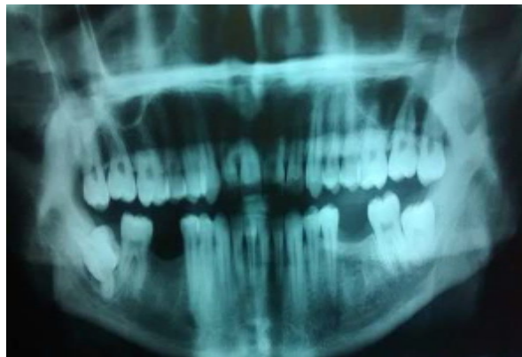
Figure 2. Unusual anatomy of lower third molar –Helicopter tooth.

On clinical examination the region of 48 appeared to be inflamed with respect to the distal gingiva of 47. The diagnosis of pericoronitis was made clinically. The orthopantogram was taken to evaluate the status of the impacted teeth of all four quadrants. The orthopantogram revealed an unusual anatomy with respect to the anatomy of the impacted 48 ( Figure 2 ).