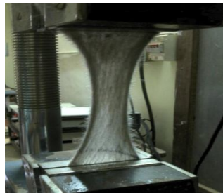
Properties of Woven and Non-Woven Geotextiles

Extensive laboratory investigations are carried out to evaluate the properties of Woven and Non-Woven Geotextile used in the study. The results are tabulated below.