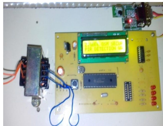
Fig.3LCD display showing intrusion detection

Then accordingly gas valve is controlled by the user. If there is a reply SMS from the user, the GSM module communicates with MCU in the same manner, but in reverse direction. The mobile phone number is first scanned, if it is authorized, MCU sends a message to the ZC which in turn sends information wirelessly to the gas valve with help of the socket through ZED.