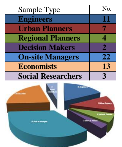
Figure 4: Participated sample in RDA model evaluation process

By applying the RDA model on the regional strategic plan to develop Suez Canal region, the following results have been obtained and recorded by different specialized groups of: