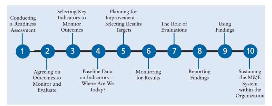
Figure 2: 10-Step Model for Building a Results-Based Monitoring and Evaluation SystemInvalid source specified.

In this context, the proposed framework follows the 10-step model principles that was presented by Jody Kusek and Risthere (Rist., 2004) (Figure 2). This model differs from others because it provides wide details on how to formulate, maintain and sustain a results-based evaluation system. It also varies from other approaches in that it covers an exceptional willingness assessment. Such an assessment must be applied before the actual formation of the system.