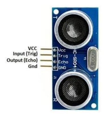
Figure 2. HC-SR04 ultrasonic sensor.

16 \times 2 LCD Display: Interfacing a 16 \times 2 LCD with an Arduino UNO is pretty easy. There are various types of LCDs available on the market, but the one we are using in this project is 162, which means it has two rows and, in each