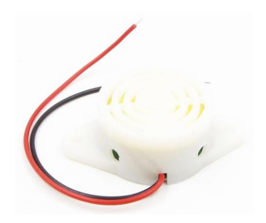
Figure 4. Buzzer.

Buzzer: The buzzer is an audio signaling device like a beeper or buzzer. It may be electromechanical, piezoelectric, or mechanical in type. The main function of this is to convert the signal from audio to sound. Generally, it is powered by DC voltage and used in timers, alarm devices, printers, alarms, computers, etc. Based on the various designs, it can generate different sounds like alarms, music, bells, and sirens (Figure 4).