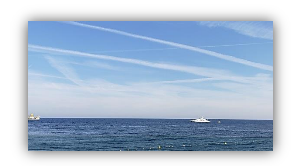
Figure 1. The red sea -Dead Sea canal project.

Vision 2030 is a plan for peace and overcoming dropped oil prices [18]. Saudi Arabia is the biggest oil exporter in the world, and its oil production costs are among the cheapest in the world [18]. Saudi GDP depends on oil export revenues.