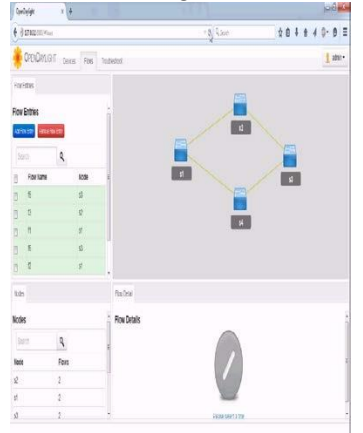
Figure 5: Routing with particular source and destination address

Figure 4: Assigning particular node id, input port and output port for the routing