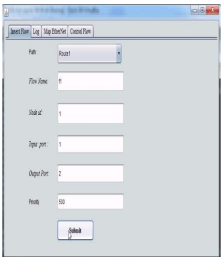
Figure 4: Assigning particular node id, input port and output port for the routing

Figure 3: Realization of switches and links in SDN controller