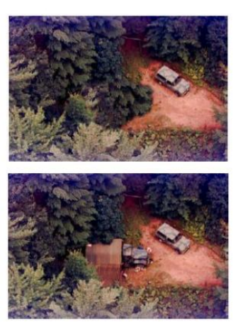
Figure 2.3 – Example of copy-move image forgery [12]

research in digital image forensics currently focuses on digital watermarking and variations of this, as previously discussed. Research conducted on image authentication in the absence of any digital watermarking scheme is still in its infancy stages [9] [12].