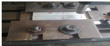
Fig.4 Setting the Al plates in Universal Milling Machine