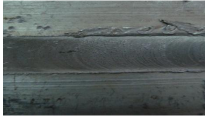
Fig.5. Al plates join by FSW