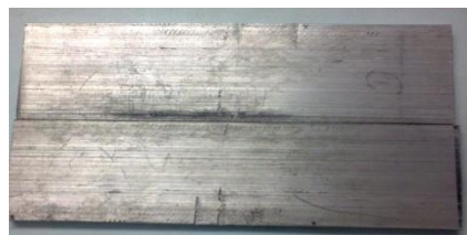
Fig.2 Aluminium Alloy plates (150mm X 50mm X 6mm)

AA 6061 Aluminium Alloy plates (150mm X 50mm X 6mm) are use for this experiment tool is designed. The material of the tool is H13 steel is used. The profile of this tool is having outer shoulder diameter of 18mm, pin diameter 6mm is use for friction stir welding for AA6061 Aluminium Alloy plates.