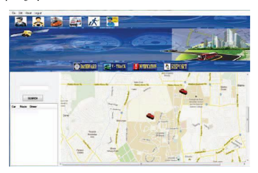
Fig.3 Dashboard for vehicle tracking and alert system

Vehicle tracking system is becoming increasingly important in rural and urban areas and it is more secured than other systems. It is more interactive by adding a display to show basic information about the vehicle and provides alert system for reporting any kind of trouble occurrences.