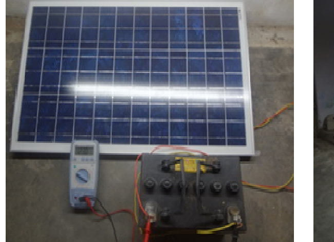
Fig 4. Experimental Work

(An ISO 3297: 2007 Certified Organization) Vol. 3, Issue 4, April 2014