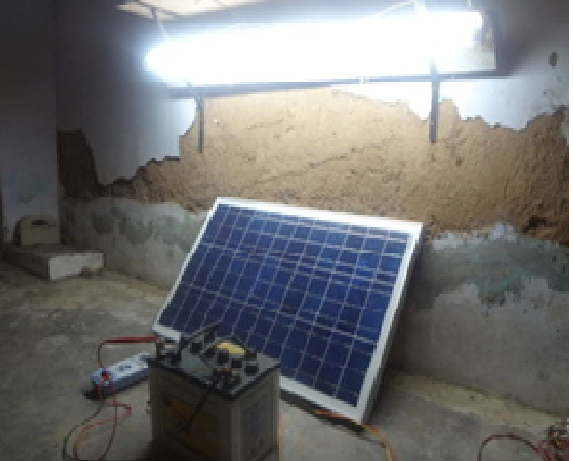
Fig. 5 Proposed arrangements

The Picture (Fig. 4& Fig. 5) indicates that high initial cost is more than offset (counter balance) by the savings in energy. I.e.: more expensive to buy, but cheaper to own because of their much lower operating cost..!! The cell efficiency which is defined as the ratio of the solar cell peak output power divided by the incident power on the solar cell is dependent on the lighting source.