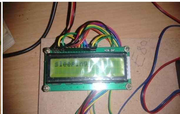
Fig (b) LCD response on drowsiness detection