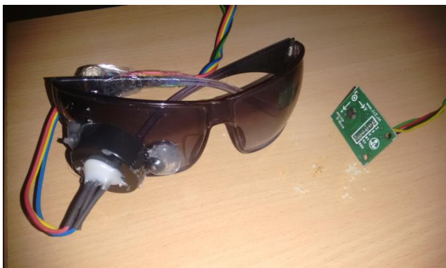
Fig (a) : IR sensor & Accelerometer

Fig (b) and Fig (c) indicates the LCD messages displayed during response of drowsiness detection conditions. In case of normal eye-blink LCD Screen displays the voltage recorded during opening and closing of eyelids. While in case of drowsiness LCD screen Shows “Sleeping” message and initiates the physical alarm.