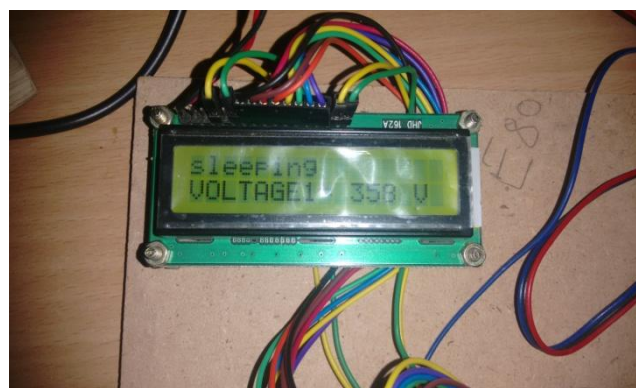
Fig (c): normal eyeblink message on LCD