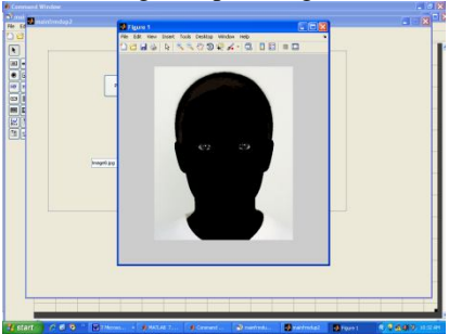
Fig b) outcome

This undergoes segmentation and is normalized. The polar co-ordinates are used for generating bit templates and is compared with the threshold value. Good results are achieved.