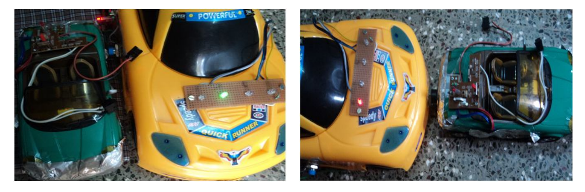
Fig: outputs of proximity sensors indicated through LED

The receiver side snapshot is shown in the mobile phone. The received information will contain the balance information and the vehicle insurance expiry date. The GUI created using visual basic will keep all the details about the vehicles passed through toll and all information can be updated and stored lifelong. The proximity of the nearing vehicle is sensed and it is indicated to the driver through LED.During snow fall or heavy rainfall the driver need not use the rear mirror for viewing the nearby vehicles. If a vehicle comes in the right side, right LED will glow and indicate the driver that a vehicle is coming right side. If a vehicle comes front or back, the front or back proximity sensors will send a signal to microcontroller , the controller will enable the LED to indicate the user.