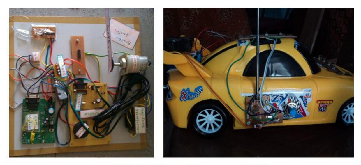
Fig: Hardware implementations of Receiver and Transmitter

This project is based on microcontroller programming. The program is written in Embedded C language and is converted into Hex file which is loaded into the microcontroller through Win PIC flash programmer. After compiling program in µcontroller flash compiler, it is loaded into PIC 16F877A microcontroller with the help of universal program burner kit FP8903 programmer which is connected to computer. After successful program burning, microcontroller becomes ready for use. In testing, after successful program loading, microcontroller is mounted on its base and hardware becomes ready for testing. If any vehicle passes through the toll gate, its toll fee is reduced and if any mismatch occurs, the vehicle is not allowed to pass. The amount deducted as a toll fee is intimated to the user as follows. Even the insurance detail of the user is intimated if it's expired.