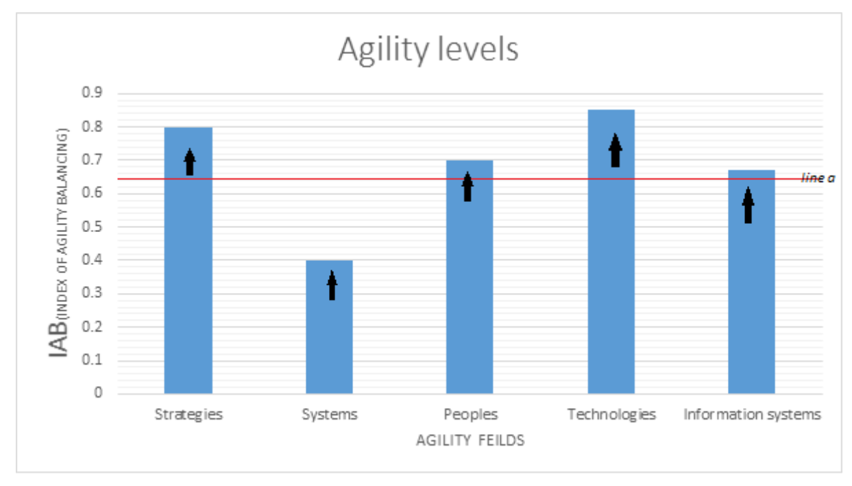
Figure 2: Agility Balancing Chart

Agility levels chart use to proper agility value between its own fields. A sample of chart has shown in Figure 2.