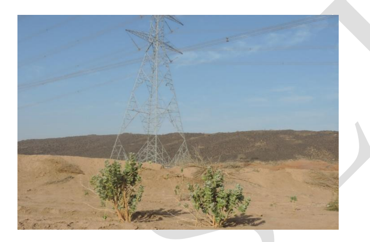
Figure 1: A photo taken by other showing example of one sampling area which describing the field conditions

The Arid conditions at the study area is extremely difficult (Fig 1). Average annual precipitation is less than 60 mm, summer temperature more than 45 °C, wind storms, wind erosion, salinity, drought and lack of fresh water resources are the key features of studied area. The climate in the study area is hot most of the year especially during summer time (Table 2). The diurnal mean of temperature fluctuated between a maximum of 39.7^{\circ} C in June and 18.8^{\circ} C in January with an annual mean temperature of 31.1^{\circ} C. Also, the minimum temperature during the night ranges between 18.6^{\circ} C in February and 29.1^{\circ} C in August with a mean of 24.4^{\circ} C in January and 34.4^{\circ} C in June with a mean of 37.7^{\circ} C. The relative humidity is high and ranged between a minimum of 81% and a maximum of 100 in December. The total precipitation is 128 mm with an average annual participation varies between zeros June to about 37.3 mm in November (Metrology and Environment, 2014).