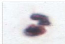
Fig 2 Cervical Image

The input image is an ultrasound image. Normally the image is in gray scale. A sample cervical image is shown Fig.2