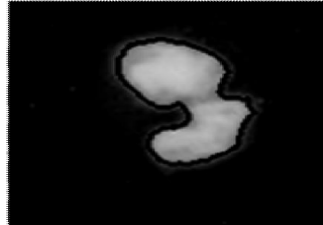
Fig 3 Segmented Image

Now that the ROI is isolated from the rest of the image we can extract the features better.