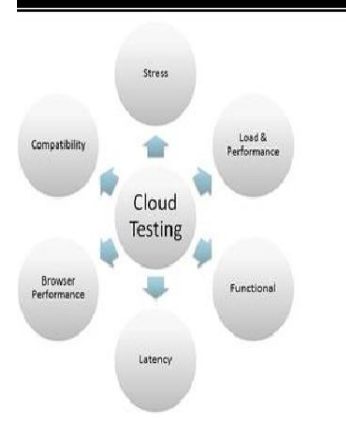
Fig2. Cloud testing methods

(An ISO 3297: 2007 Certified Organization) Vol. 2, Issue 2, February 2014