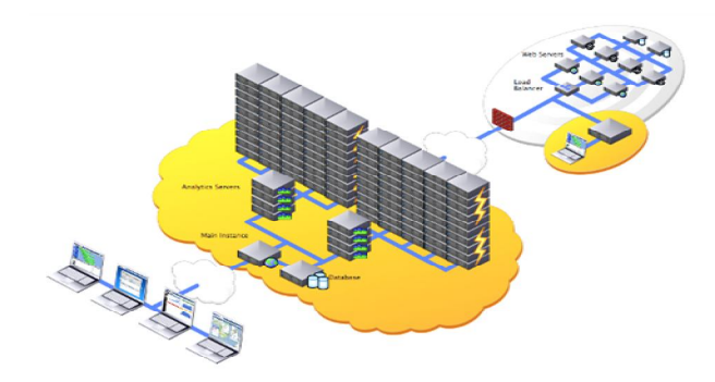
Fig.5. SOASTA Architecture

SOASTA CloudTest is deployed as an on-demand service, leveraging the cloud to generate the load. It is comprised of the methodology described above, the services provided by our experienced load testers, and the Global Cloud Test Platform that provides a cross-cloud infrastructure for generating load. Within the application, open source libraries are a fundamental part of the offering, used throughout the product for providing various functions. SOASTA provides the software as part of the service. As seen in Figure 1, CloudTest is deployed using a distributed architecture in the cloud, complemented by an appliance for testing behind the firewall.