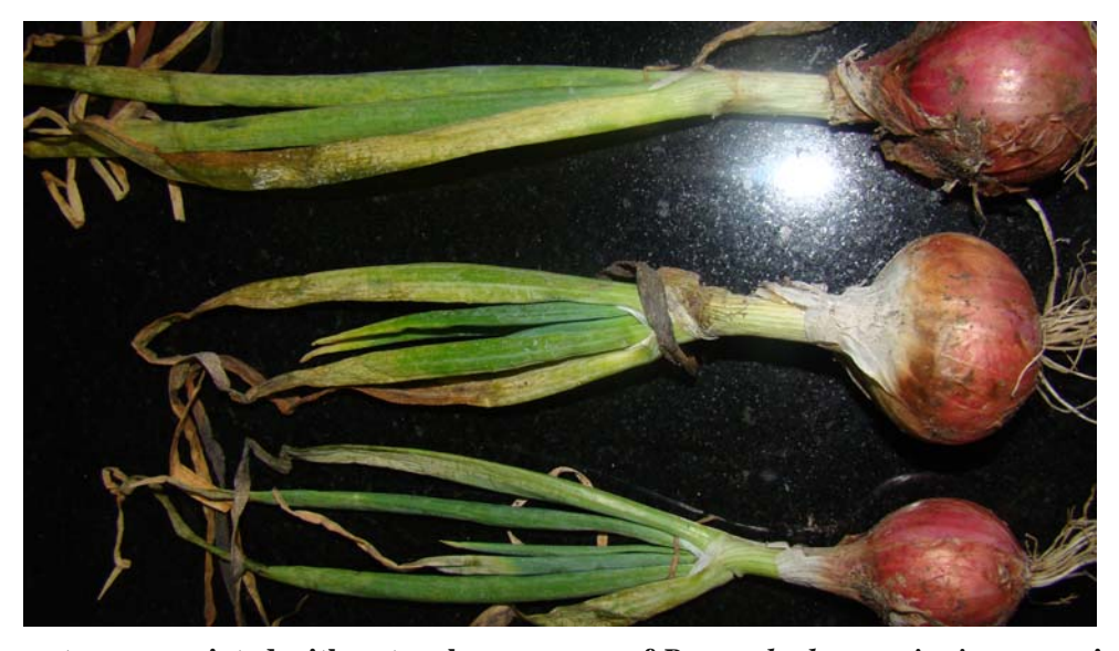
Fig. 1: Symptoms associated with natural occurrence of Peanut bud necrosis virus on onion: straw colored, mosaic and necrotic lesions were observed on the young leaves.