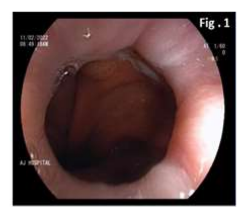
Figure 1. Endoscopy showing grade 1 esophageal varies.

A 58 year old male presented to surgery outpatient with history of abdominal bloating for 2 months. Clinical examination revealed no abnormality. Upper gastrointestinal endoscopy revealed grade 1 esophageal varices (Figure 1) with portal gastropathy (Figure 2). CT scan showed cavernous transformation of portal vein with no evidence of portal vein thrombosis (Figure 3). Main portal vein not visualized from its confluence. Scan also revealed retro aortic left renal vein (Figure 4) with normal renal parenchyma. Patient was conservatively managed and is closely followed up.