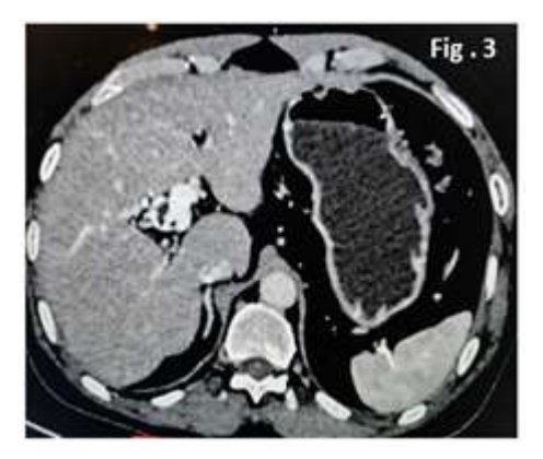
Figure 3. Axial CT Image showing non visualization of main portal vein.