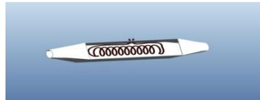
Fig: Heater vessel

The heating vessel for the pre heater is fabricated using 2mm mild steel plate. Six plates of required size was cut and fabricated as a cuboid by welding its edges. Proper type welding rod was used for welding. Healthiness of welding was ensured by dry penetrate test. Two nozzles were incorporated for facilitating air to flow inside and exit out. A filter has been provided at the inlet of heater for removing the dirt present in the air. Thermocouples have been incorporated at the inlet and outlet lines of the heater. In addition one more thermocouple is fixed to measure the exhaust gas temperature. The heater is installed in the heating vessel and electrically isolated from the heating vessel. The out let of heater is connected to the engine.