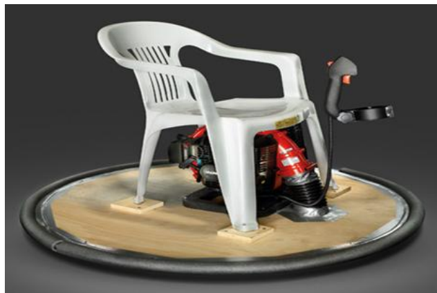
Fig: 2 – Hovercraft