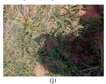
Figure.1.Photoplates of Weed samples: (a) Cardus nutans L. (Asteraceae), (b) Cerastium fontanum Baumg. (Caryophyllaceae), (c) Celome viscosa L. (Capparaceae(d) Euphorbia maculata L. (Euphorbiaceae), (e) Helianthus tuberosus L.. (Asteraceae), (f) Lactuca serriola (Asteraceae) (g) Phyllanthus niruri L. (Euphorbiaceae), (h) Sinapsis arvensis L. (Brassicaceae), (i) Vernonia cinerea Schreb. (Asteraceae), (j) Veronica arvensis L.

To observe the allelopathism the method with slight modification from Rosario Garcia Mateos et al.[4] and Sangita Chandra et al.[3] were followed. Seeds of rice,mung(green gram)and mustard pre-soaked with the solution(36mg of alkaloidal scrapings from the filter paper dissolved in 10ml of distilled water) of each alkaloidal extract for 72 hours and then were allowed to germinate over the moist filter paper placed inside petri dishes with a diameter of 9cm at room temperature to observe the percentage of germination and then transferred to trays containing soil for their survivality [Fig.2. -(a) to (k)]. Results were statistically analysed by chiscquare test with reference to the percentage of germination in the control set with distilled water and recorded in the table.