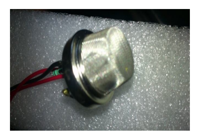
Fig.3: Gas Monitoring