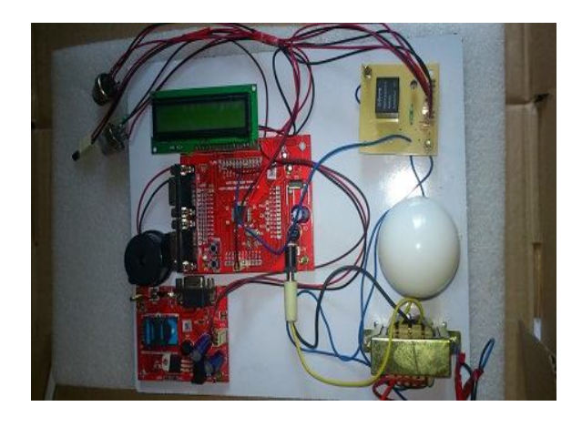
Fig.5: Proposed image

The objective of proposed system is to integrate and test the effectiveness of innovative persuasive strategies delivered via an intelligent electronic system infrastructure that is able to infer and reason the energy behavior of the households, Received from a number of different sensing technologies; (1) electrical mains circuit sensing, (2) individual appliance level sensing, (3) ambient sensing such as temperature and (4) gas mains sensing.