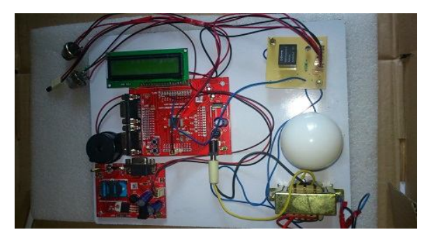
Fig1: Proposed image

The objective of proposed system is to integrate and test the effectiveness of innovative persuasive strategies delivered via an intelligent electronic system infrastructure that is able to infer and reason the energy behaviour of the households, Received from a number of different sensing technologies; (1) electrical mains circuit sensing, (2) individual appliance level sensing, (3) ambient sensing such as temperature and (4) gas mains sensing. Electrical data collected via the first three sensing methods share the same architecture design on data communication, analysis and display. As domestic gas consumption data are collected, extra considerations need to be focused such as safety regulation and power supply.