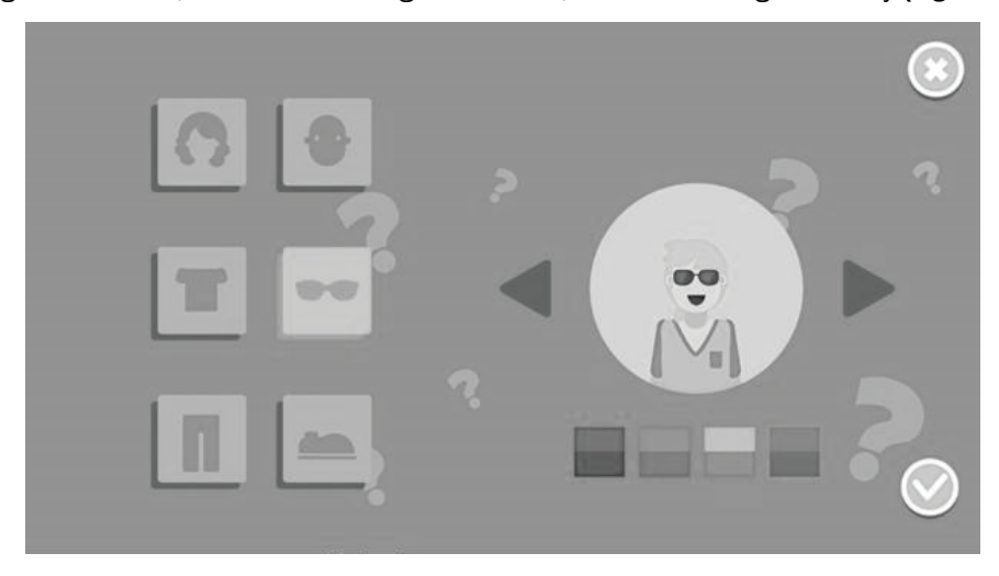
Figure 4. Game scenarios (1st) skating in the park, (2nd) snorkeling at the beach, (3rd) snowboarding in the snow, and (4th) skating in the city.

to nature and daily life in different contexts of physical activity/sports. The game integrates 4 different scenarios: 1st skating in the park; 2nd snorkeling at the beach; 3rd snowboarding in the snow; and 4th skating in the city (Figure 4).