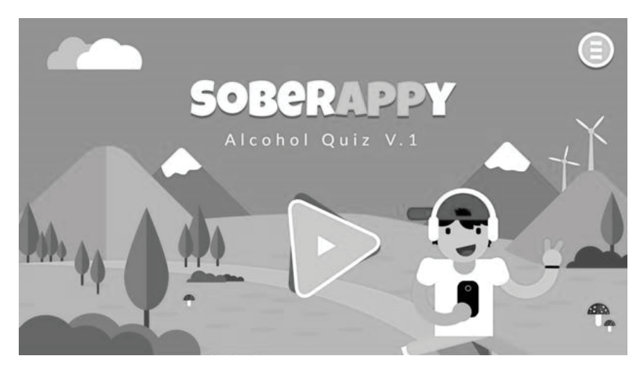
Figure 1. Initial screen of the game.

Then screen 2 (Figure 2) shows a message that challenges the player, presenting the theme of the game. On this screen, the player can select one of three options: start a new game, continue a game; or check credits of an already started game.