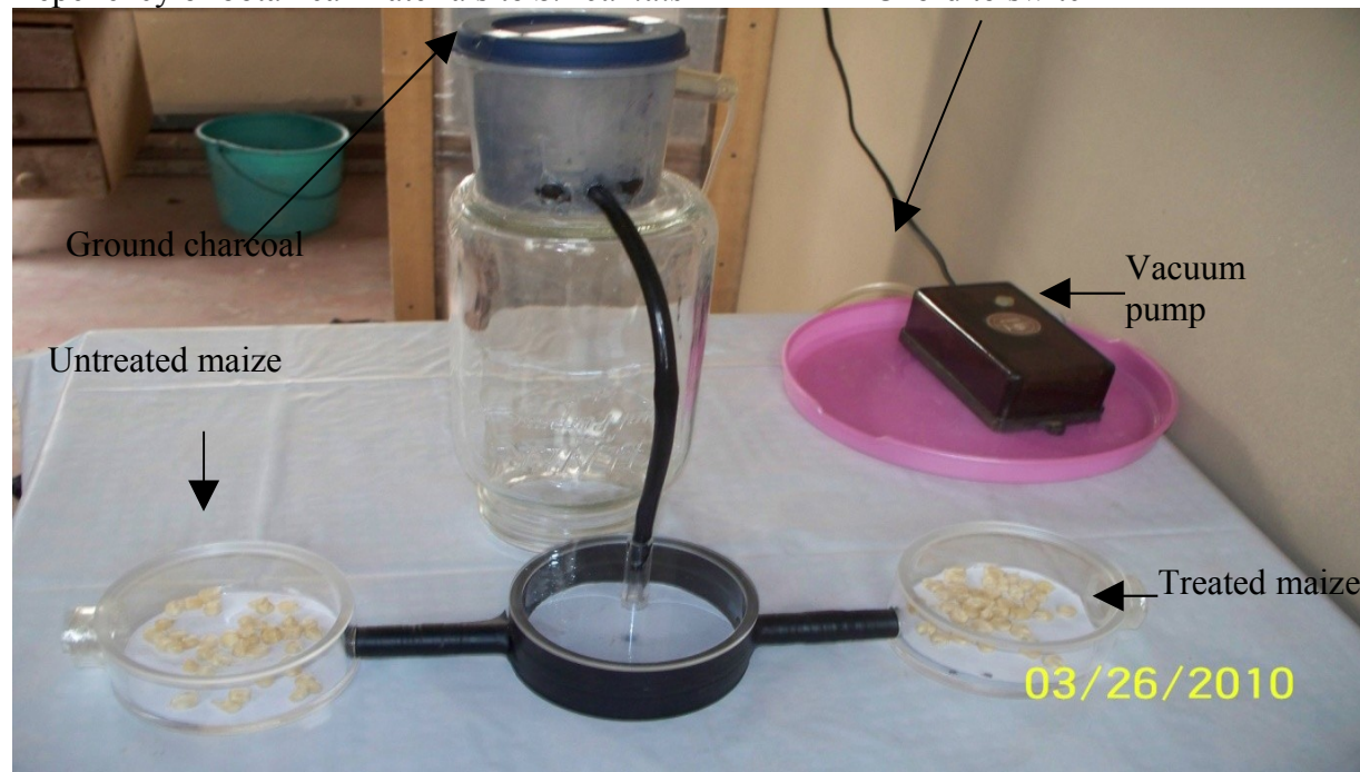
Plate 1: An olfactometer set up to study repellence of botanical extracts to S. zeamais