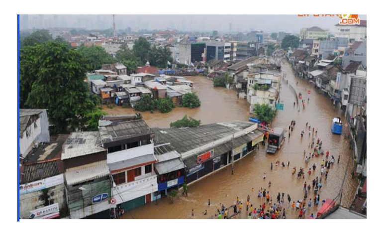
Fig.1 The water flood in a settlement region located nearby river due to water flow from highland area undergone heavy rainfall (http://www.liputan6.com/tag/banjir-jakarta) [15]

With regard to the historic waterways in comprehensive urban planning of a mega city development, several conditions have taken attentions including low basin areas, large rivers flowing from rainy highland resources, overloaded settlement, disordered city development, violations on environmental regulations and different socio economic backgrounds that all are strongly related to environmental awareness. A defect comprehensive urban planning is implicated with uncompleted survey causing lack of important urban information, unintentional stimuli, less strengthening in promoting environmental awareness, general knowledge and perceptions, as well as unsustainable pro-environmental behavior [7]. Fig.1 shows the water flood in a settlement region located nearby big river caused by water flow from highland area undergone heavy rainfall. Uncompleted survey gives strong impacts on disordered urban planning associated to low environmental awareness, lack of environmental behavior and practices, as well as low environmental concerns.