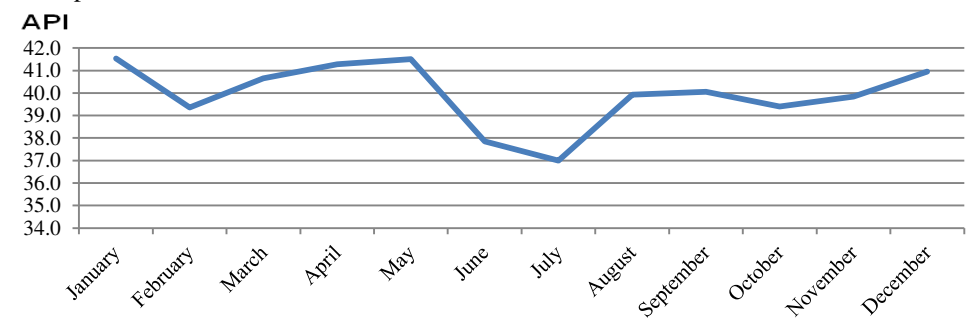
Fig 2: Air pollution index at SMV school station 2013

The analysis of air quality data of the city shows that the principal component exceeding prescribed limit is suspended particulate matter. Average day time concentration of SPM in the study area is found as 75 \mu g/m³. As per the API analysis, the air quality of Thiruvananthapuram falls in the border case moderate air pollution. Fig 2 shows high fluctuations according to the season. Highest at summer and lowest in monsoon owing to the contributions of variation in suspended particulate matter concentration.