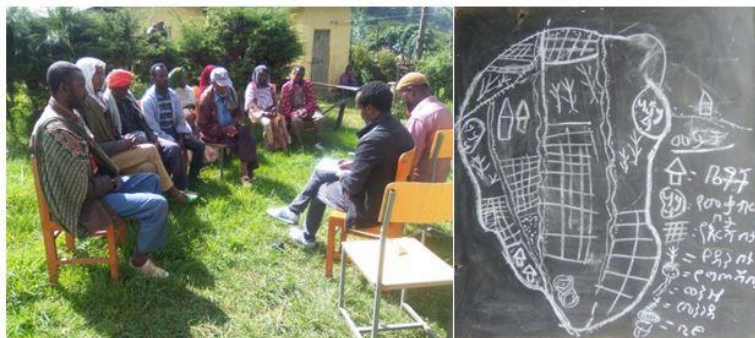
Figure 2. Group discussion and diagram of the catchment drawn by participant farmers.

Finally, for each plant species determine the score of abundance which is highly (3), medium (2), low (1) and absent