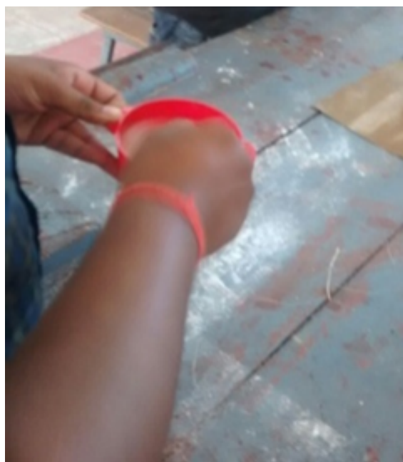
Figure 6. Mixing of the resin.

first in a container the resin and hardener are added in ratios and mixed in the container for a time until we get a good vertex in the middle of the solution in the container ( Figures 6 and 7 ).