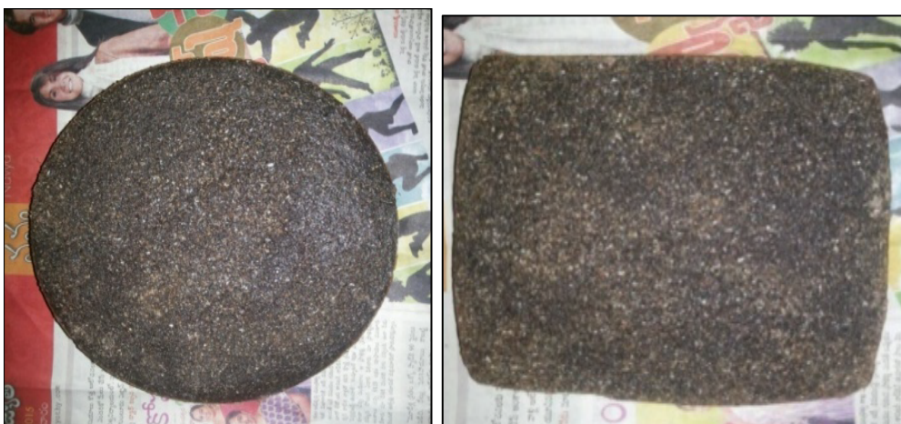
Figure 8: Composite material made out of different die

The composite made out of prawn shell powder is a bio-degradable material that can be easily discarded into the environment easy to use. It doesn't require any plants or sites to grow the raw materials [6,7].