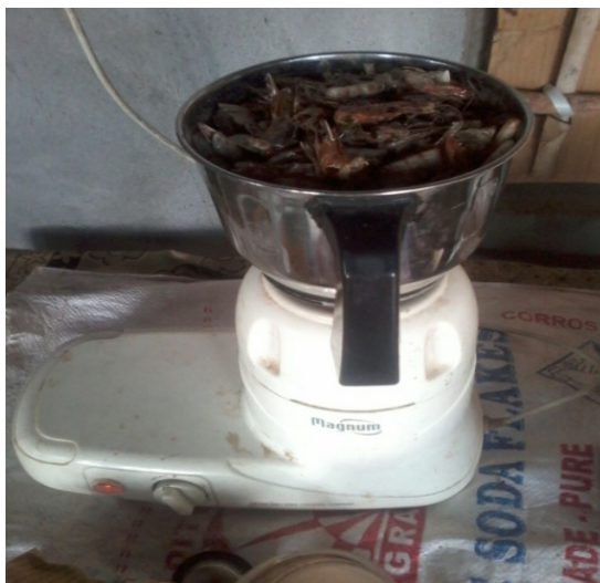
Figure 3. Blending of dried prawn shells.

The prawn shell powder is a particulate reinforcement in the composite as it is taken in the powder form. The Figures 3 and 4 below shows the blending and the drying of the prawn shell powder that is used as a reinforcement in making the composite material.