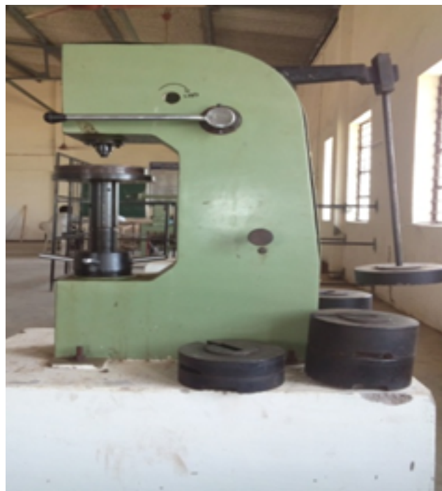
Figure 10. Hardness test equipment tests piece.

At a load of 750 kg, it has a hardness number of – 52.1