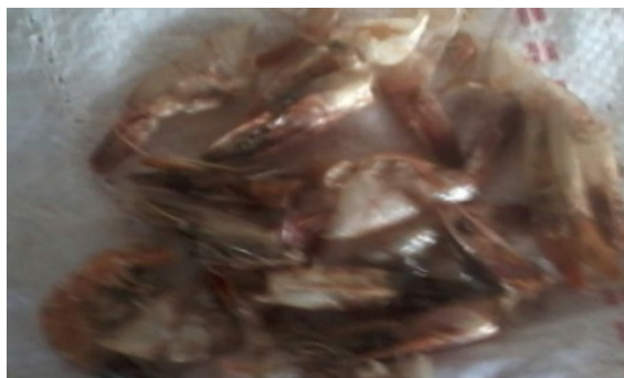
Figure 2. Dried prawn shells.

Those dried prawn shells which are completely dried and are ground into a powder using a blender for 3-4 times as shown in the figure below. The fine powder of prawn shells is collected as in required quantity.