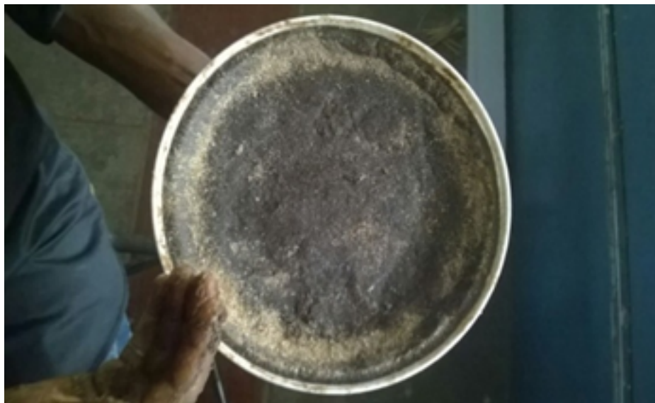
Figure 7. Powder mixed with matrix.