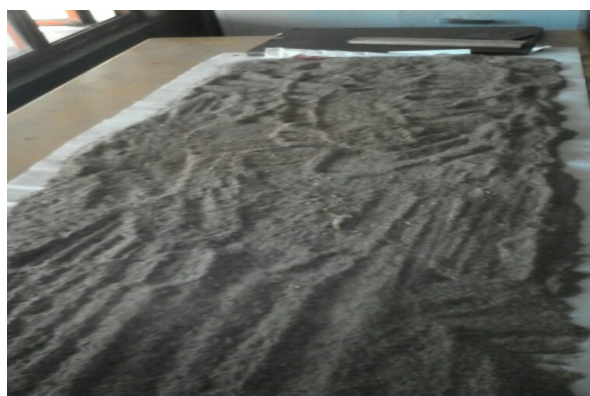
Figure 4. Drying of prawn shell powder.

The general understanding of shell secretion is that it begins with the formation of periostracum extruded from the periostracal groove. Upon reaching the tip of the outer mantle lobe, it is reflected back and a calcareous outer layer initiates slightly within or immediately below the internal layer of the periostracum. However, some bivalves defy this model and can secrete calcareous matter before the shell layers are laid down. In these cases, the secreted matter protrudes from the periostracum in the form of needles or pins, which represent a highly organized and early phase of mineralization, differing from the normal shell secretion process.