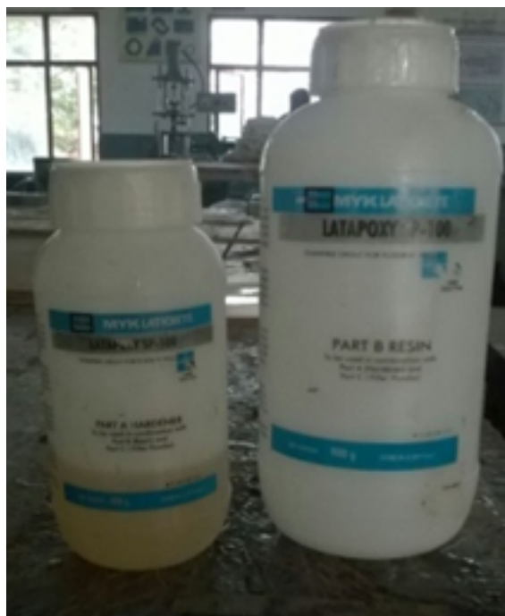
Figure 5. MYK Laticrete - latapoxy resin and hardener.

first in a container the resin and hardener are added in ratios and mixed in the container for a time until we get a good vertex in the middle of the solution in the container ( Figures 6 and 7 ).