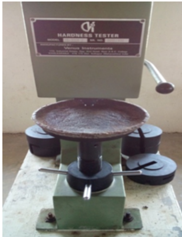
Figure 9: Hardness test.

is conducted on the test piece placing the load and using a circular ball indenter of 10 mm to take the readings on the test piece. Basing on the diameter of ball indenter, the values of the hardness numbers are noted regarding the diameter. The hardness number determines the strength of the particulate composite material ( Figures 9 and 10 ).