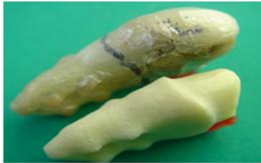
Fig. 1 Implant before insertion, and a copy of the extracted tooth with macro-retentions.