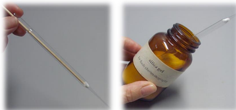
Figure 2. Pressing the cloumn.