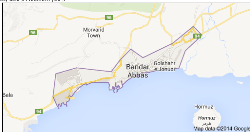
Figure-1: Location of Samples collection

A. lycioides and A. wendelboi fruits were collected in June 2013 from Sirmand mountains near Hadji-Abad County, Hormozgan Province and the mountains in Gnow protected area, Bandar-Abbas, Hormozgan Province respectively. Both samples were identified by R. Asadpour. The Geno Biosphere Reserve, with a total area of 27,500 hectares, situated in the Hormozgan province of Iran. It has been designated as a protected area by the Iranian Department of Environment in 1976. The area is mountainous region that located among plains and hills. The region's geographical location "18 ° 27 to" 29 ° 27 north latitude and "18 ° 56 to" 56 ° 55 'east longitude, is located in the north of Bandar Abbas (Figure-1). Plain part of the region includes much of the southern, eastern and northern part of the strip consisted of alkaline and saline soils contain large amounts of soluble salts such as chloride, sulfate and carbonate of Ca, Mg, sodium, and potassium [23].