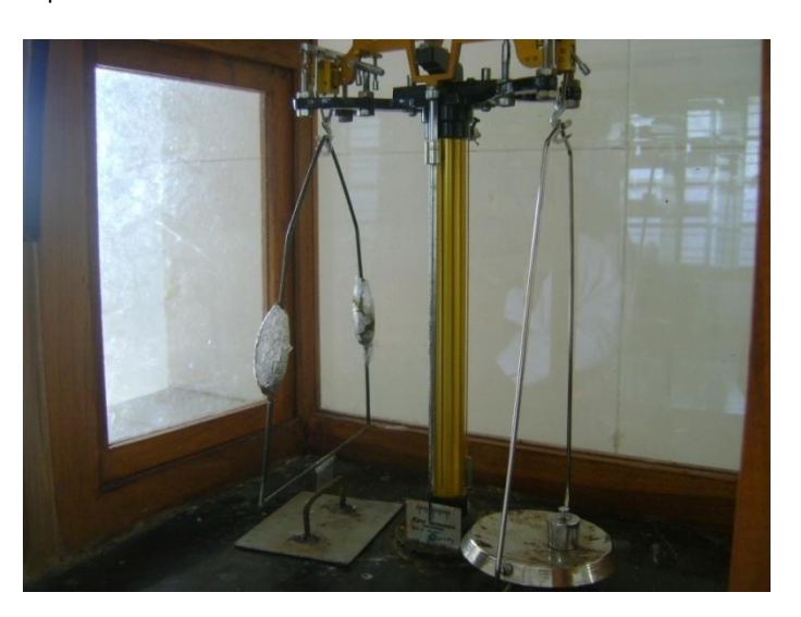
Figure 1: Tensile strength apparatus