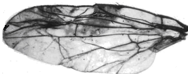
Figure 1: Tephritis zernyi Wing (Female)

Length, 0.59 mm. Width 2.70 times greater than length; frons 1.84 times wider than eye, yellow, with thick pollinosity; frontal stripe yellow, with a few pale yellow hair; ocellar triangle and bristles black, acuminate; 2 pairs of inferior and 2 pairs of superior frontal orbital bristles; inferior pairs, lower superior pair and inner vertical bristle pairs acuminate, brown to black; upper superior pair, postocellar, postvertical and outer vertical bristle pairs lanceolate, pale yellow; postorbital bristles mixed, acuminate which are brown to black and lanceolate which are pale yellow; face 1.19 times longer than antenna, yellow, without any spot or band; epistome projecting forward, yellow; gena 1.36 times wider than 3 rd antennal segment, yellow, with 1 brown to black bristle pair; subocular spot absent; mouthparts capitate; antennal segments yellow except apex and outer surface of 3 rd fulvous, 2 nd with short black hair, 3 rd pointed at apex and 1.5 times longer than wide, arista with short pubescence, black with fulvous base; occiput yellow except upper middle half fuscous.