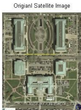
Figure 3 Original Satellite Image

To ascertain the effectiveness of the proposed Local histogram equalization RE algorithm over other wavelet-domain RE techniques, different LR optical images obtained from the Satellite Imaging Corporation webpage [1] were tested. The image of Washington DC ADS40 Orthorectified Digital Aerial Photography –0.15 m is chosen here for comparison with existing RE techniques.