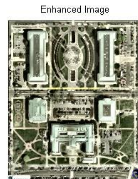
Figure 4 Resolution Enhanced Image